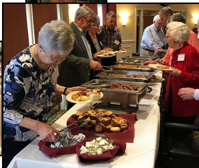
Our delicious fare... and enough for seconds.

Come join us next year. It's always fun, relaxing, and a great start to your weekend! Just keeps on getting better with each passing year.