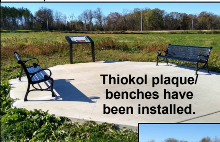
Thiokol plaque/benches have been installed.

This effort is proceeding well, as you can tell from the below photos.