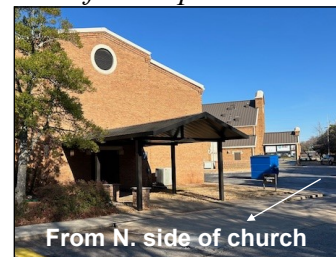
From N. side of church