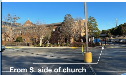
From S. side of church

When you enter the building, just follow your nose straight ahead to the smell of breakfast being prepared by our own crew! The ambiance will be different, but the camaraderie will be the same.