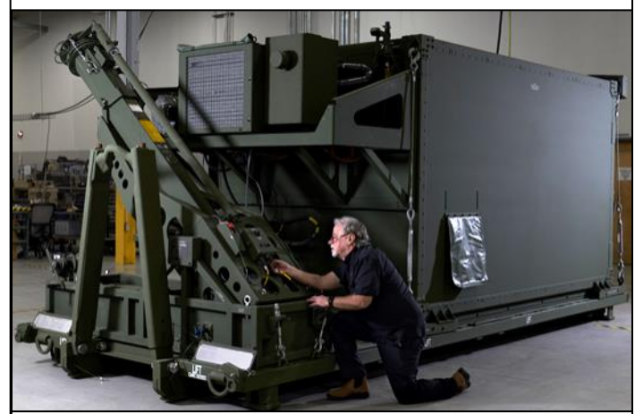
NG produces major end items, like the Engagement Operations Center (EOC) for the U.S. Army in Support of Poland at its manufacturing center in Huntsville, AL.

(Excerpt from news.northropgrumman.com/news/releases/northropgrumman-secures-1-4-billion-in-contracts)