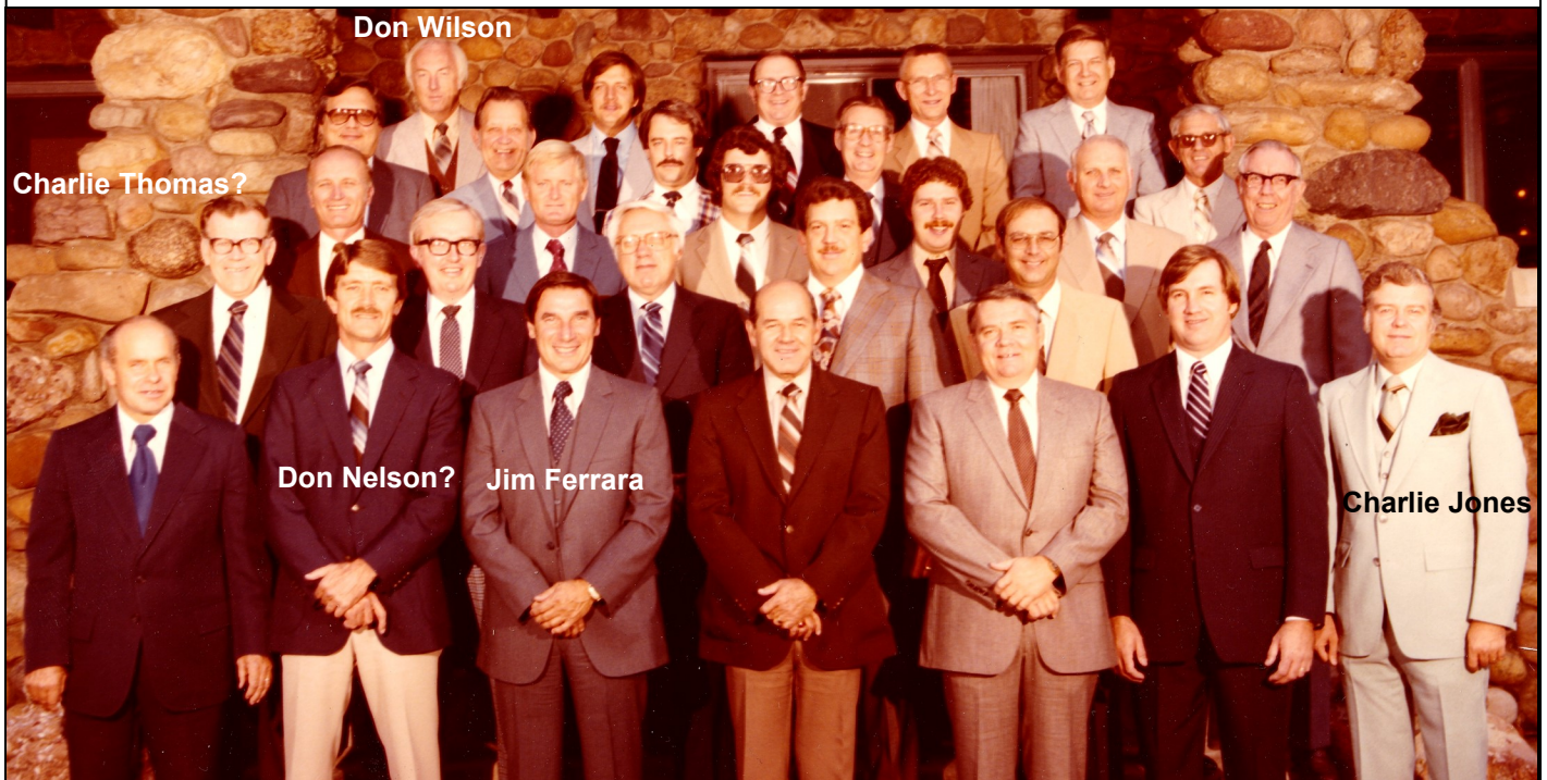
This "blast from the past" photo was taken at the Thiokol Management Training Center in Ogden, Utah, 1981. Perhaps not all attendees were from Thiokol/Huntsville Division. Can you spot a few who were? (Hint: you might need a magnifying glass!) This photo was also posted to the HDAA Facebook site. Post names if you can find folks you know. Just trying to tax your gray matter a bit.....and help rekindle my own.